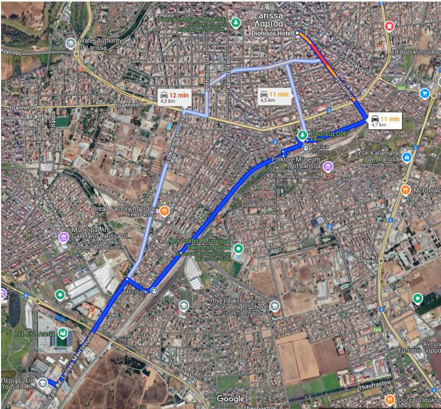
Hotel Dionysios – HALL1 11 minutes