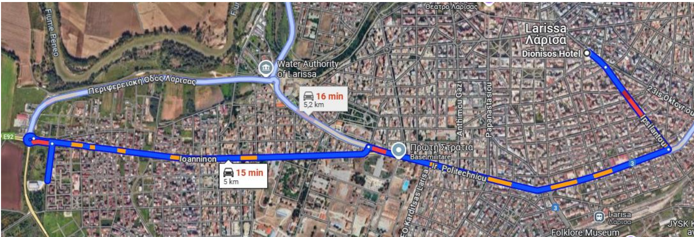
Hotel Dionysios – HALL2 15 minutes